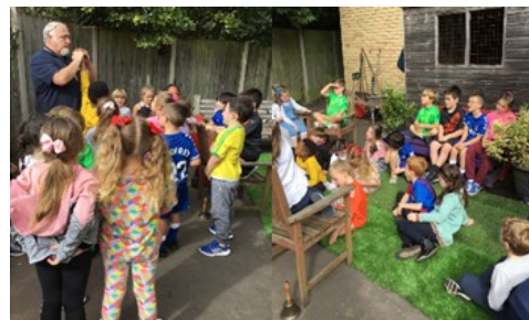
Meeting our new therapy dog

Y2 have had a great time this term. Lots of fun within our creative curriculum and a chance to get back, meet friends and begin our new and exciting educational journey.