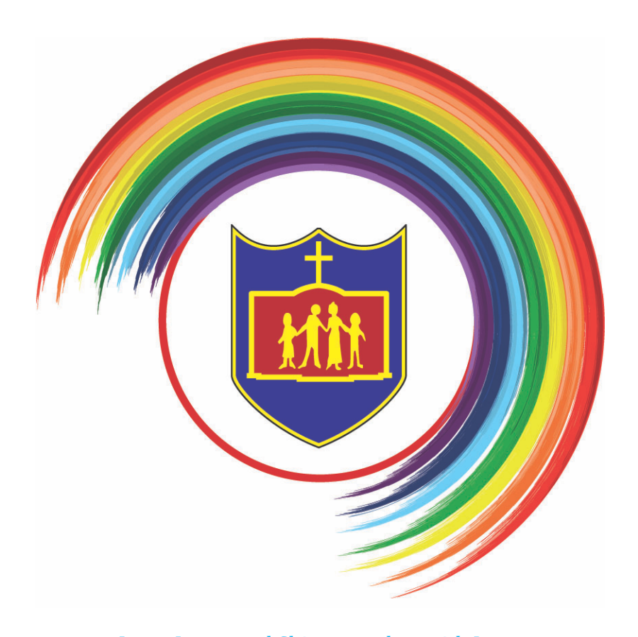
Love, Learn and Shine together with Jesus